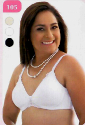
Petite T-Shirt Bra